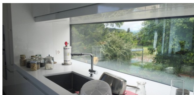
Flush glazed window in a kitchen.